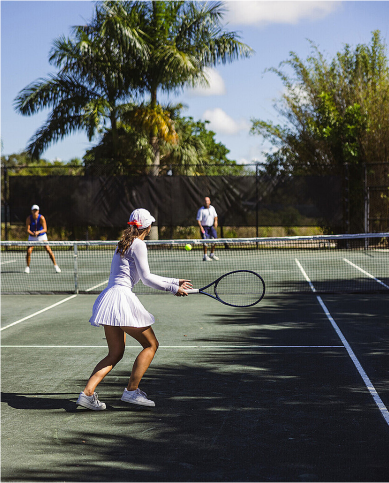
The Racquet Club

With six meticulously maintained Har-Tru courts, head to The Racquet Club to enjoy the game and play at your own pace - from practice and private instruction to spirited matches. Then, take a break at the curated grab-and-go refreshment bar.