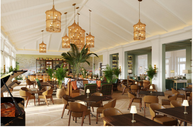
The Merchant Room