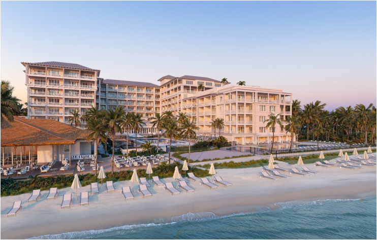
Naples Beach Club

From grand events in the ballroom or intimate gatherings in a private dining room, Naples Beach Club offers stunning, versatile indoor and outdoor venues to suit any style. Let our talented team curate every flawless detail for a memorable experience, whether it is a business meeting in the board room or a birthday celebration at HB's.